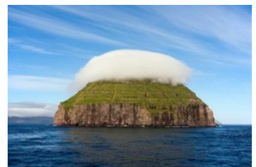
The Cloud Covered Island of Litla Dimun

It was her daily fifteen minute fast write, in response to this picture: